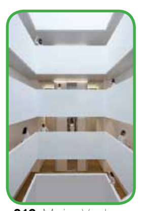
019 _Marina Verde