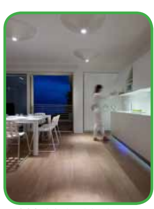
009 Marina Verde