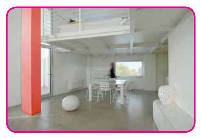
7_casa marco balestri