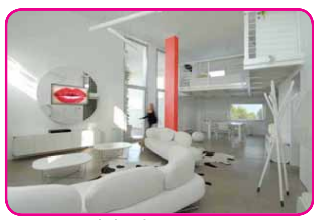
1_casa marco balestri

A loft is above the kitchen area, creating an intimate, but full of light, place of relax and from which you can enter in upper floor composed by bedrooms and bath area. Spaces of the second floor follow the same logic of functionality and no conventions of the first floor, becoming softer and more comfortable as you move to bedrooms. The three-dimensionality of bath breaks traditional stereotypes, recreating itself starting from real needs of contemporary human beings. Essential and geometric red columns characterized the spaces of the house and they contribute to expand its uniqueness.