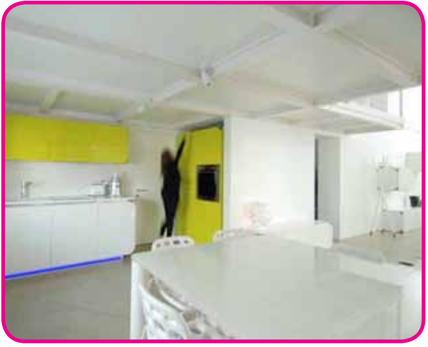
4_casa marco balestri