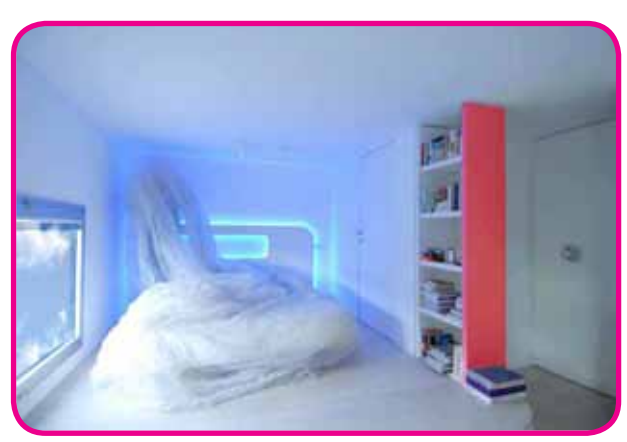
008_casa marco balestri