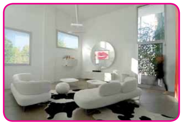
3_casa marco balestri