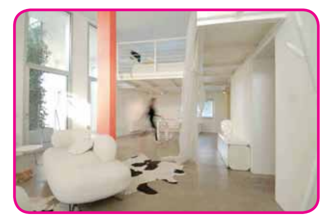
9_casa marco balestri