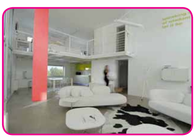
2_casa marco balestri