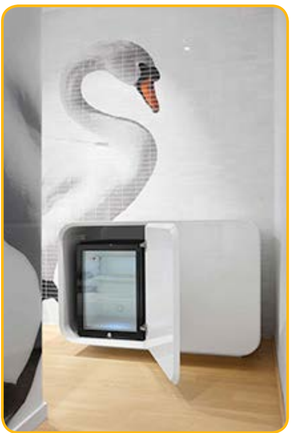
Swan Room 06