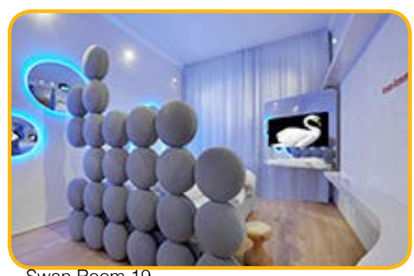
Swan Room 19