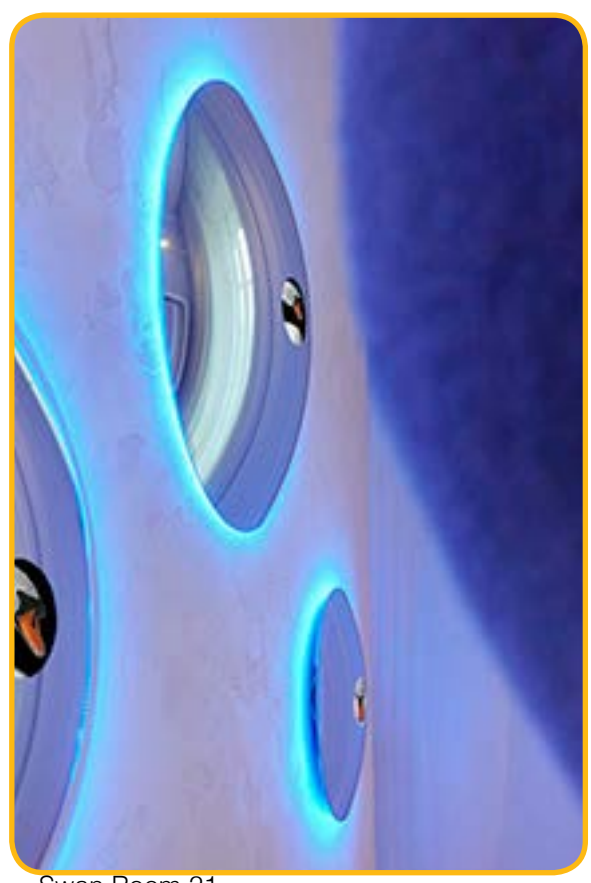
Swan Room 21