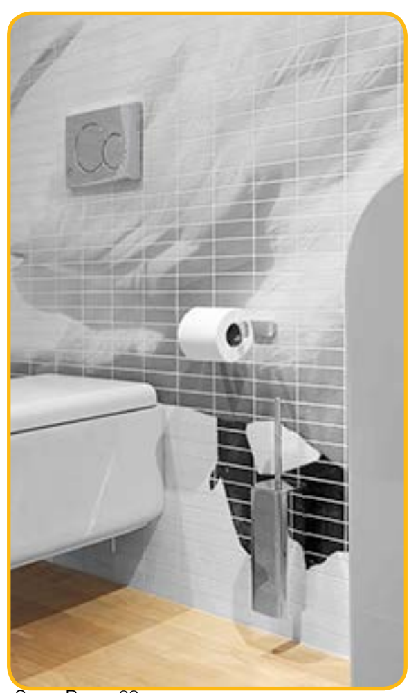
Swan Room 08