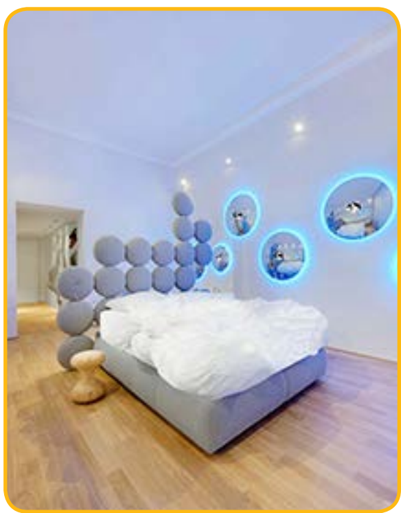
Swan Room 16