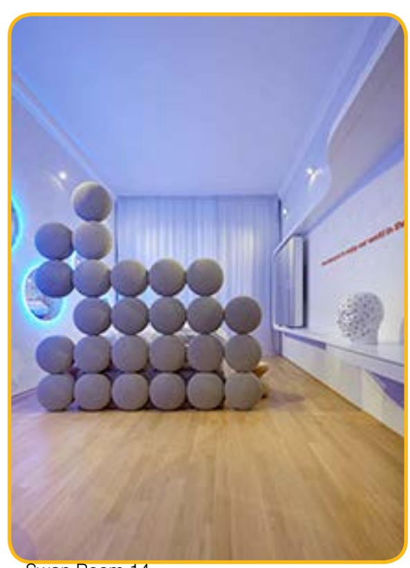
Swan Room 14