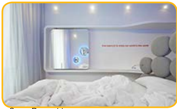
Swan Room 11