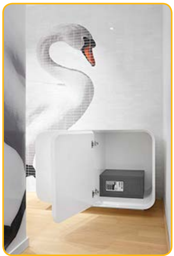
Swan Room 07