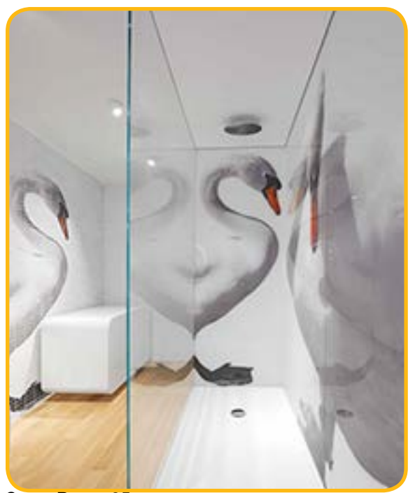
Swan Room 05