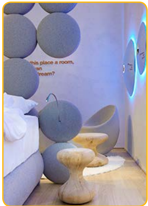
Swan Room 23