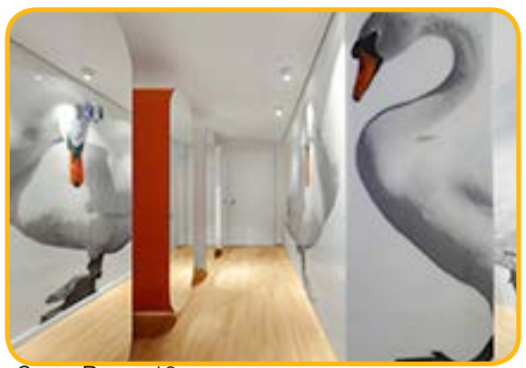
Swan Room 10