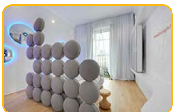
Swan Room 18