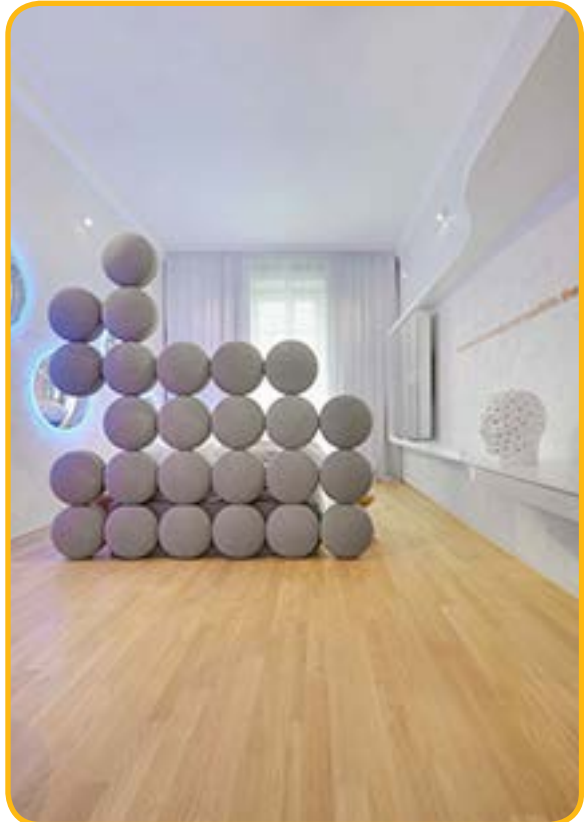
Swan Room 13