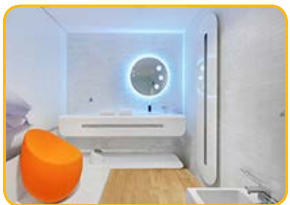
Swan Room 02