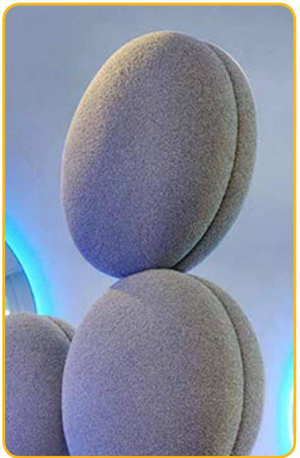
Swan Room 22