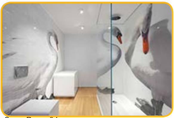
Swan Room 04