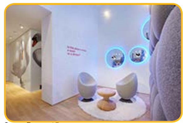
Swan Room 15