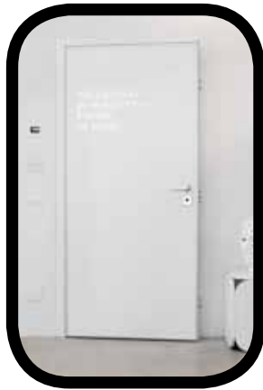
001_Simone Micheli Studio-gallery