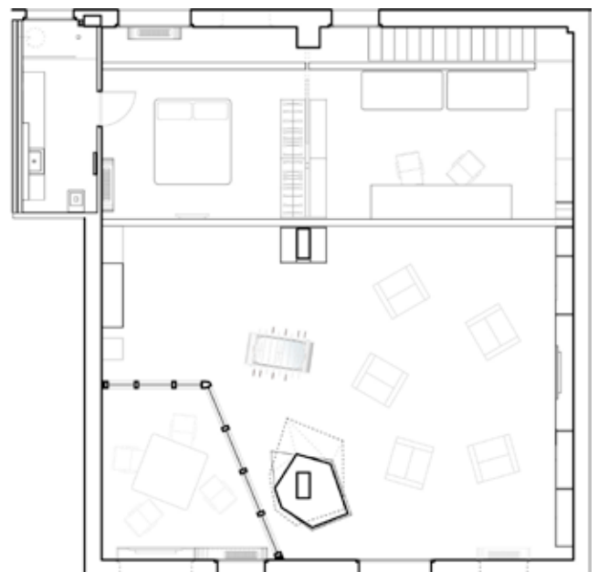
ground floor and loft plan