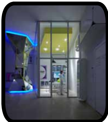
004_Simone Micheli studio-gallery