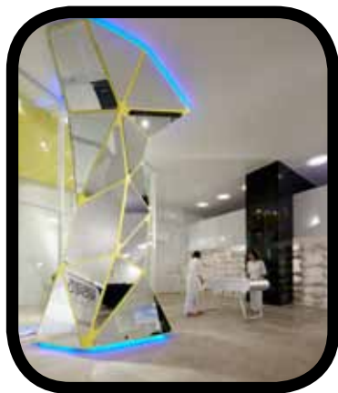
010_Simone Micheli studio-gallery