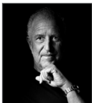
Simone Micheli Architect

T he latest dream of architect Simone Micheli has taken shape and become reality at 1300 m. above sea level. Terme Alte di Rivisondoli, a recently opened spa and wellness facility, expresses excitement, rigor and simplicity. Fully integrated with the wild nature of the Abruzzo mountains—still little known despite their rare beauty—Terme Alte is a project not only of aesthetic refinement, but also of intelligence and strategic design and communication. Set in a natural corner equidistant from the tourist centers of Roccaraso, Rivisondoli and Pescocostanzo, thanks to the expressive power of its spaces and the high quality of the treatments it offers, this oasis of relaxation aspires to become a major attraction, a means for energizing, enlivening and invigorating the handsome plateau it overlooks, the ski resorts of the surrounding mountains, the nearby golf courses and equestrian club, and the cycle hiking paths and that wind through the woods that surround it on three sides. Here Micheli has transformed his vision into a project of excellence and acumen.